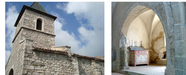
The remote, abandoned parishes of the Bugey mountains became the first mission fields of the pioneer Marists.

The Marist group was soon asked to take over the bishop's secondary school at Belley — and the Marist Fathers entered