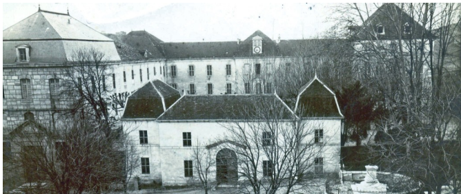
The college at Belley — Fr Colin, the educator

the world of education. Fr Colin soon provided his fellow teachers with firm, gentle guidelines which were to inspire later generations of Marist educators.