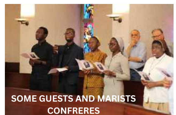
SOME GUESTS AND MARISTS CONFRERES