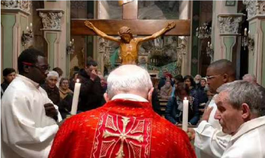
CORSO FRANCIA (TORINO)

Holy week was again celebrated in a special way in Casa di Maria. Students of Casa di Maria join the other Italian communities and confrères to celebrate the Holy Week. This moment allows the students to experience mission work in apostolic communities in Italy. The celebration was good with full engagement of the seminarians in, Pratola, Torino, Castiglione Fiorentino and Rome. Below are photos of some of the activities.