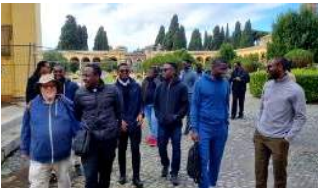
Departure towards the graves of deceased confreres