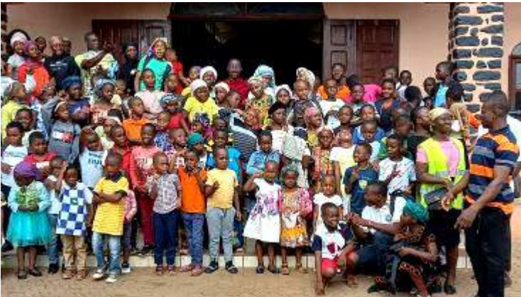
Clovis and the mass servants of Obili (Cameroun)