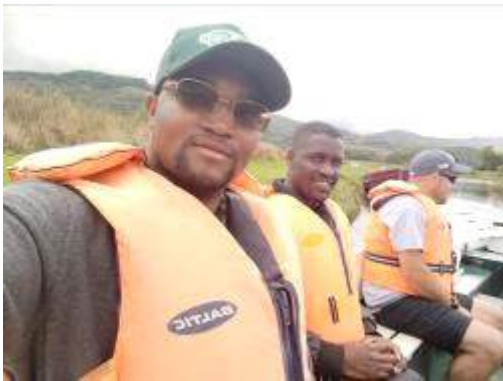
In the mountains at Killarney