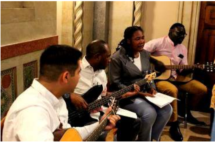
Some of the musicians from Casa di Maria