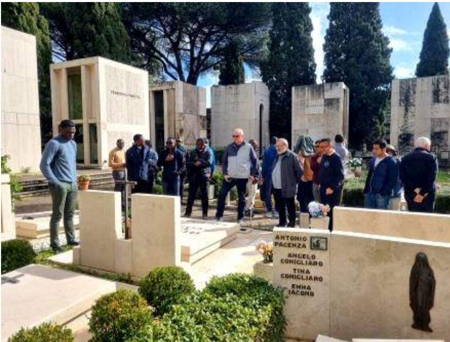
Praying at the graves