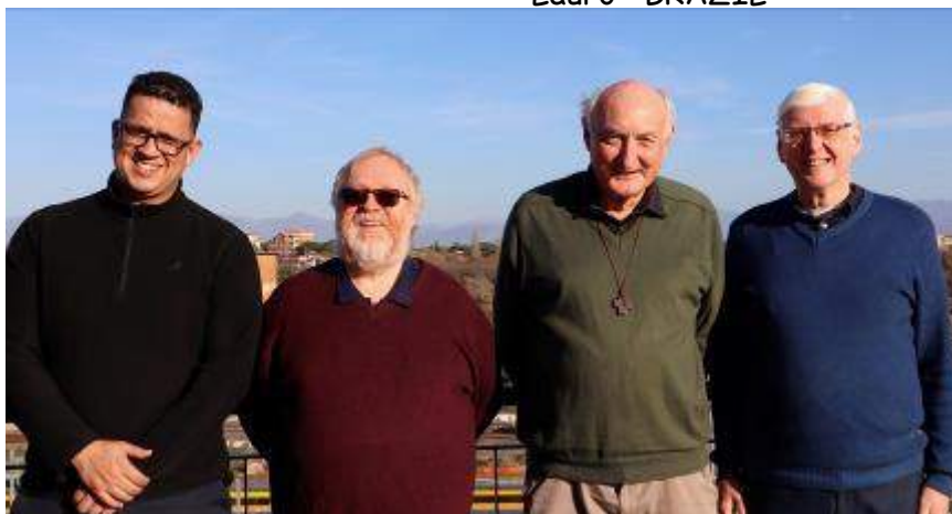
Formation team with the Superior General

Même arbre, même branche, même pluie et même soleil, mais chacun à sa particularité... Ainsi est la vie ; On ne mûri qu'en son temps, travaille, prie et patiente, ton temps viendra certainement. Si tu réussis à comprendre cette image, tu as compris la vie.