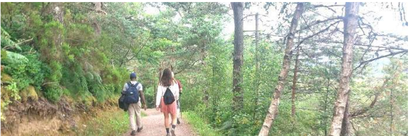
Camino in Spain