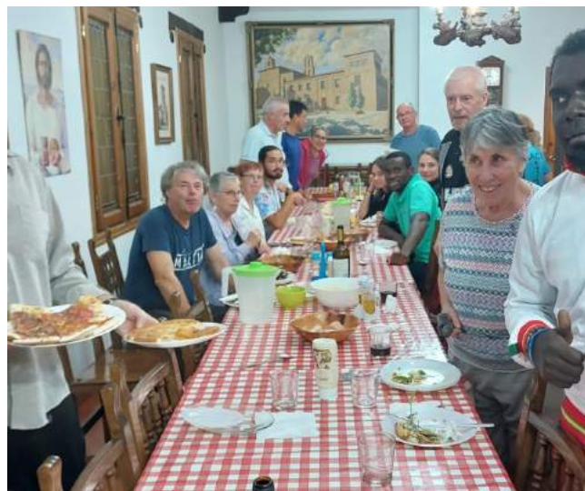
Having dinner with the pilgrims