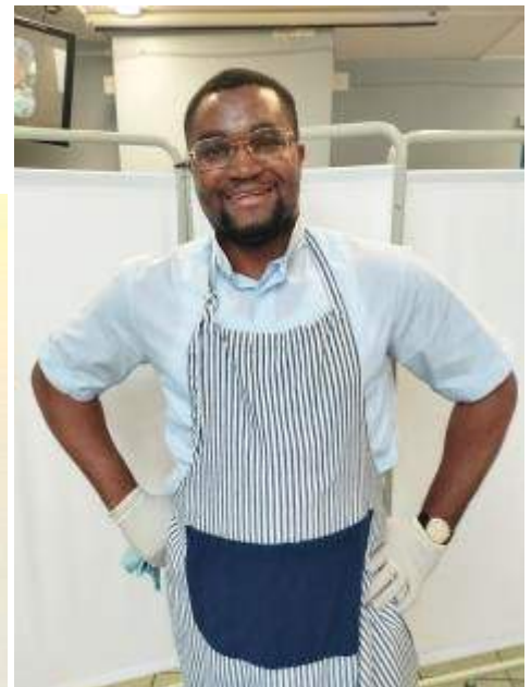
Helping at Capuchin Day Center