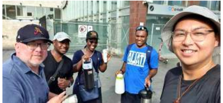
Pastoral in Termini with refugees