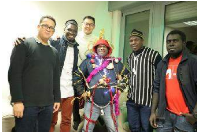
La Neylière group