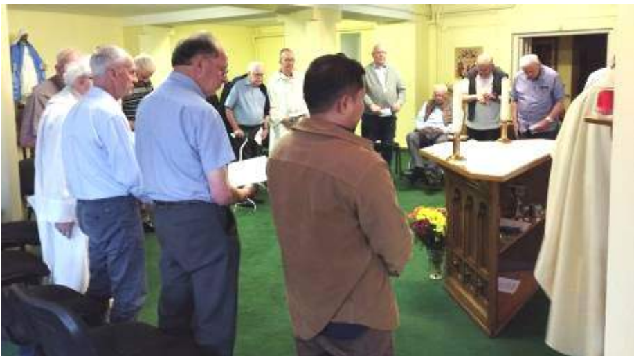
Celebration of the Holy Name of Mary