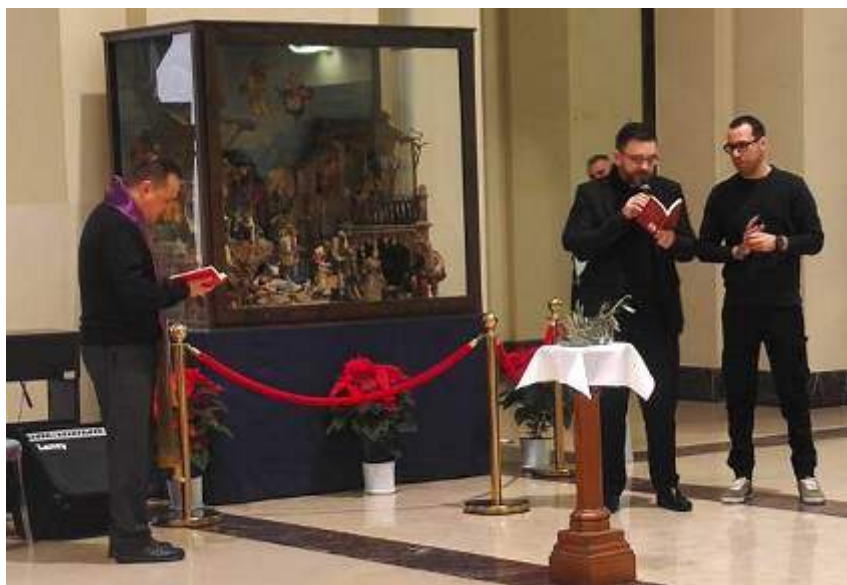
Blessing of the Christmas crib at the Pontifical Gregorian University