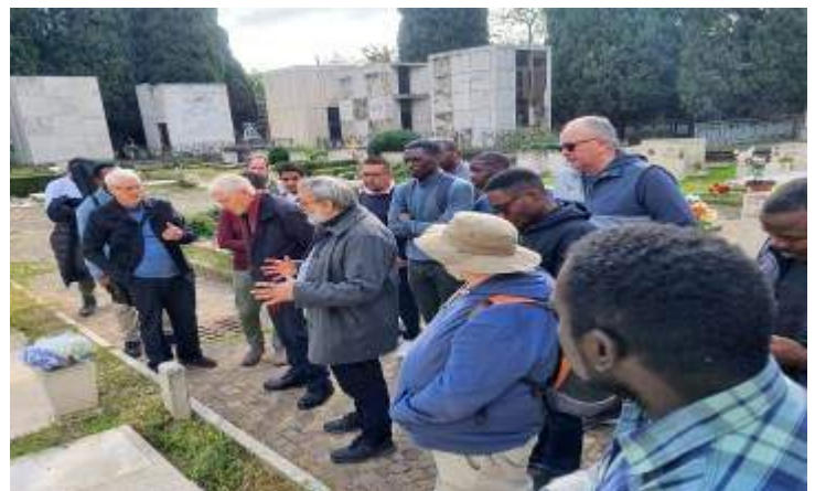
A little sharing about the lives of deceased colleagues known by confreres