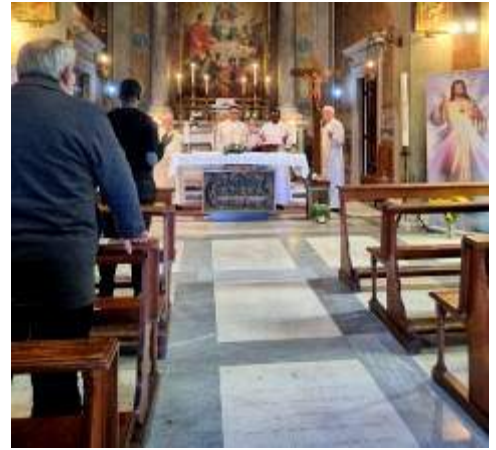
Mass in the chapel of the cemetery