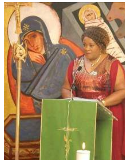
Clinton's aunt reading at the ordination mass