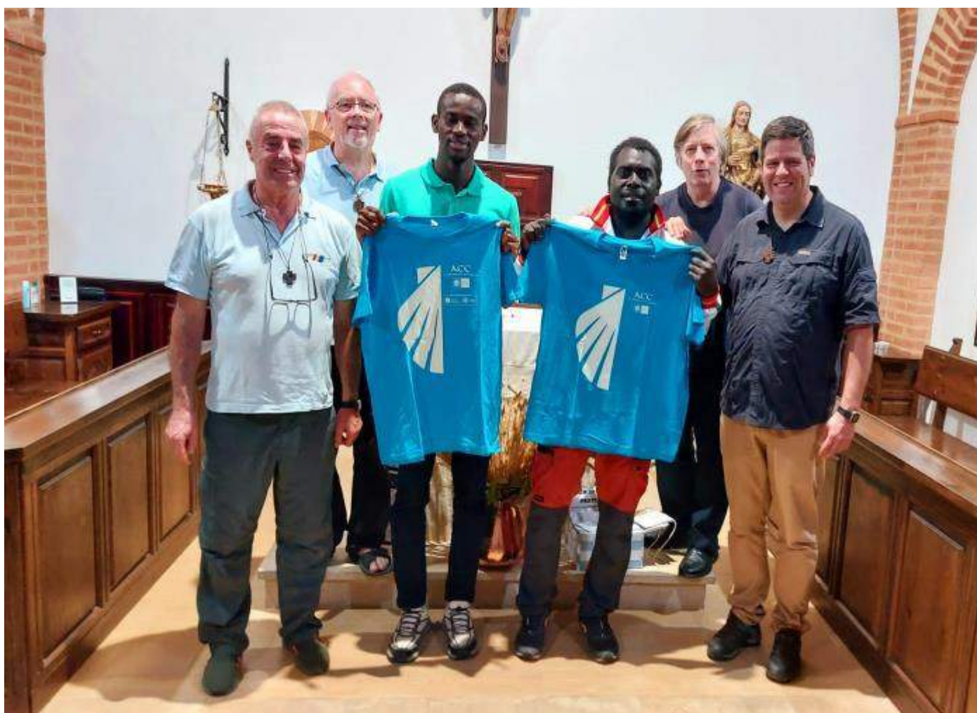
The Community of Sahagun