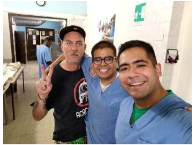
Pastoral care with migrants at Centro Astalli