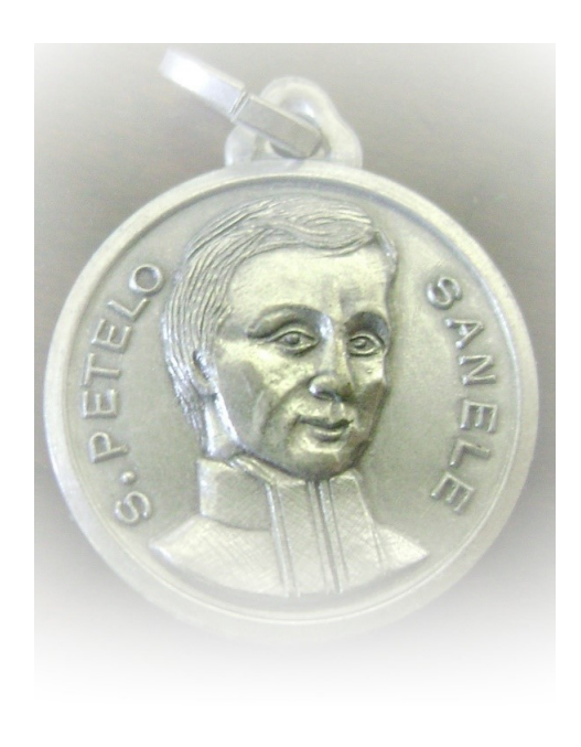
They knew he loved them